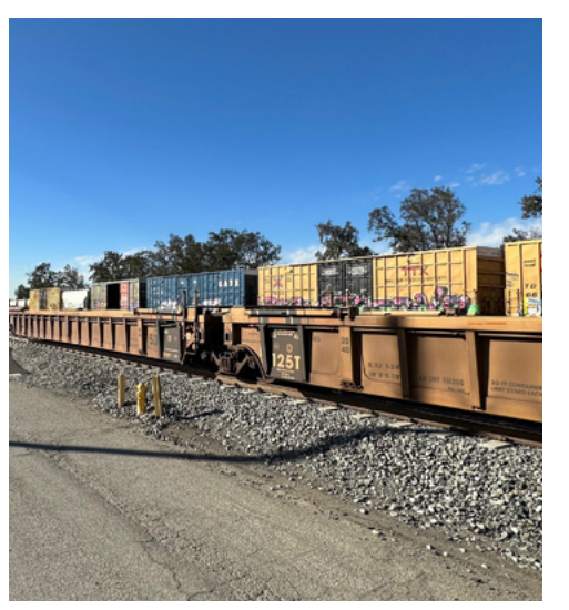
The Rail Yards ISR will become effective after the U.S. Environmental Protection Agency approves the Rail Yards ISR and CARB's associated rules on locomotives and drayage truck fleets.

Yards ISR was carefully developed over the course of seven years through extensive outreach, beginning in 2017. Public input and feedback were solicited by engaging with various stakeholders, including communities impacted by freight rail yard emissions, potentially affected businesses and industries, environmental organizations, trade associations, public agencies, and others.