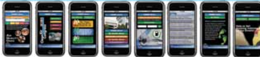
Air Quality Clean Air Congress What I Can Do News Alternative Fuels Events Carbon Footprint Smoking Vehicles

T he South Coast Air Quality Management District has launched the nation's first fully featured smart-phone application for a wide range of air quality information.