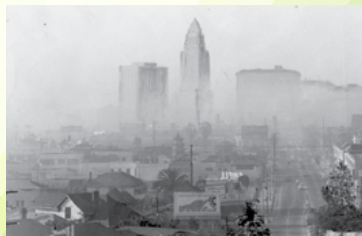
Downtown Los Angeles City Hall 1968