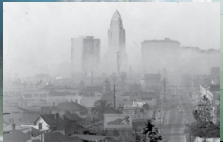
Downtown Los Angeles City Hall in 1968