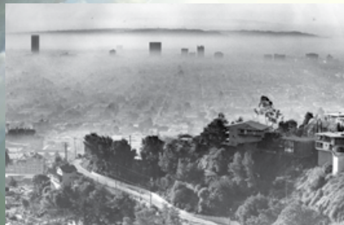
South Coast Basin Panoramic shot 1964