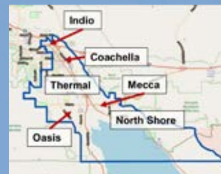
Proposed maps of year two communities