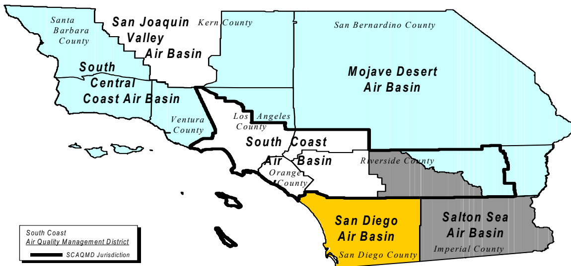
Figure 1-1 Boundaries of the South Coast Air Quality Management District