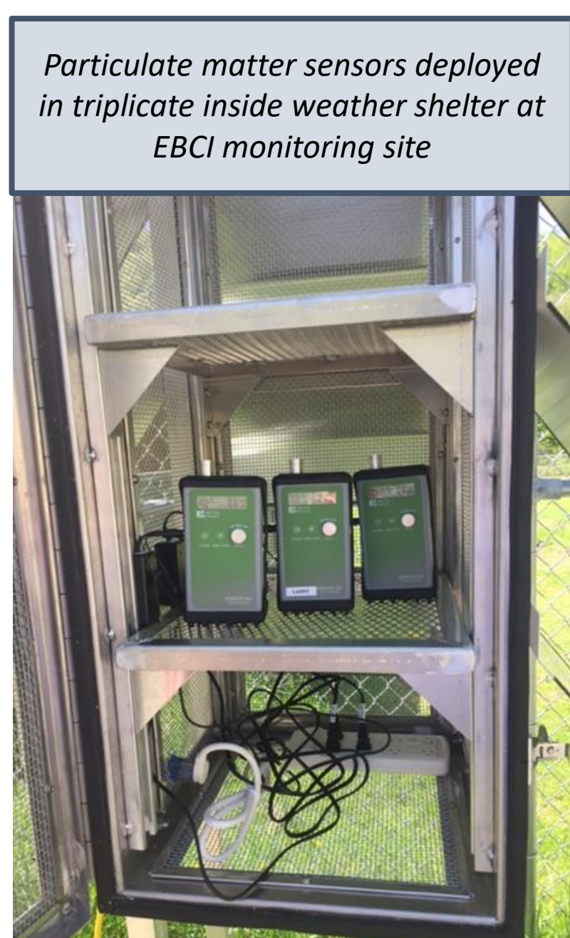
Particulate matter sensors deployed in triplicate inside weather shelter at EBCI monitoring site