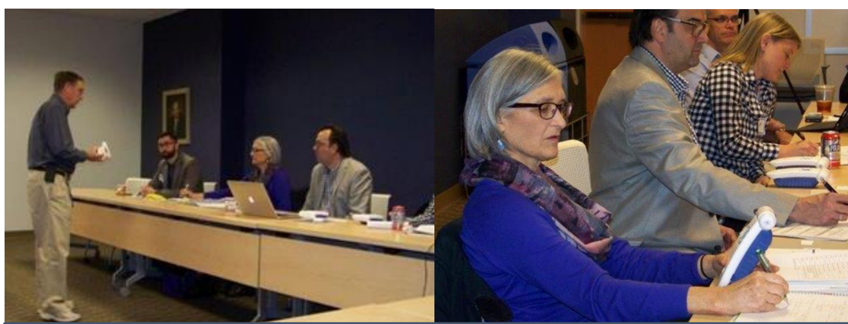
Training for CAC staff, Mecklenburg County staff, and citizen volunteers