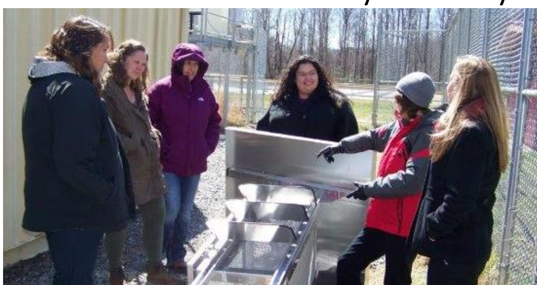
EPA and EBCI partners reviewing assembly of weather shelter provided by EPA