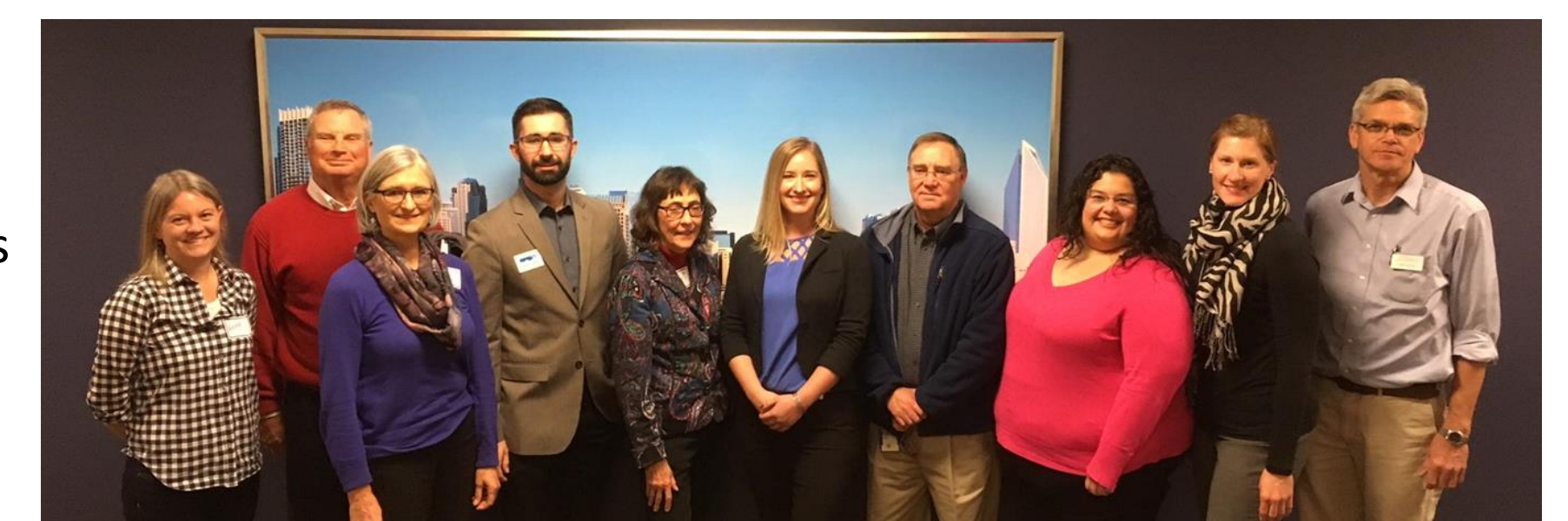
Citizen volunteers with staff from CAC, EPA, and Mecklenburg County