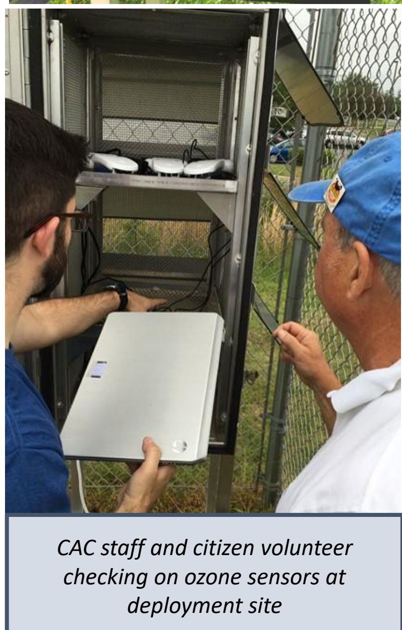
CAC staff and citizen volunteer checking on ozone sensors at deployment site