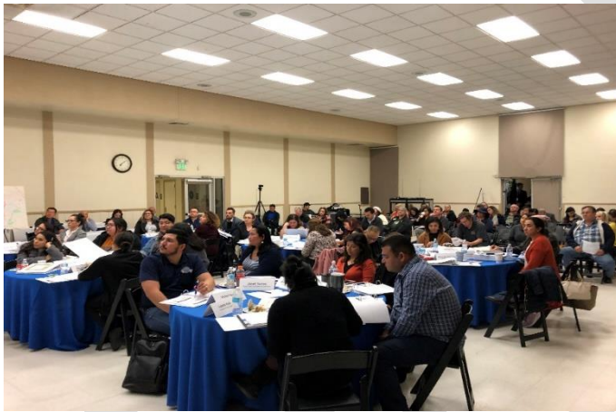
Figure 2-3. Community Steering Committee meeting #1 at Veterans Park in Bell Gardens on February 6, 2020.

During the CERP and CAMP development process, the CSC developed the air quality priorities, strategies and actions, and provided feedback on the draft plans. CSC members were also invited to provide suggestions for agenda items for each meeting.