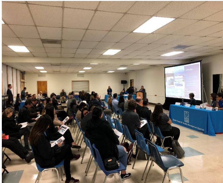
Figure 2-3. SELA community kick-off meeting at Salt Lake Park Recreation Center in Huntington Park on January 9, 2020.

The SELA Community Kick-Off Meeting was held on Thursday, January 9, 2020 in the community (Figure 2-3). During this meeting, staff presented information about the AB 617 program and the critical role of the CSC in the development and implementation of the