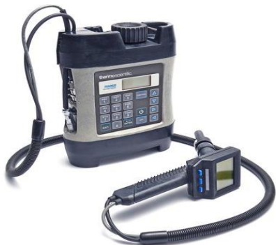
Figure 4-1: Portable instruments used by South Coast AQMD inspectors in the field

Toxic Vapor Analyzers (TVA): Inspectors can use TVAs to measure the level of certain gases in a specific area. This includes methane and volatile organic compounds (VOCs), which are emitted by petroleum sources and other types of sources.