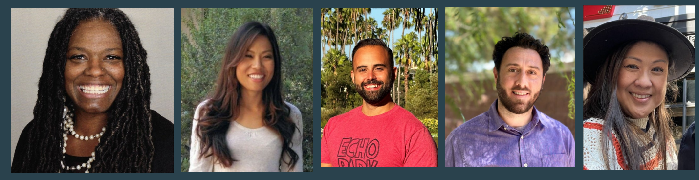
Diversity, Equity, Inclusion with Community Air Program (DEI+CAP) Leadership